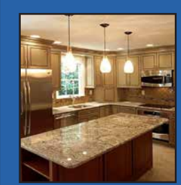
LICENSED BONDED . INSURED